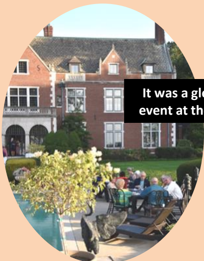
It was a glorious day for our event at the Hanna Mansion.