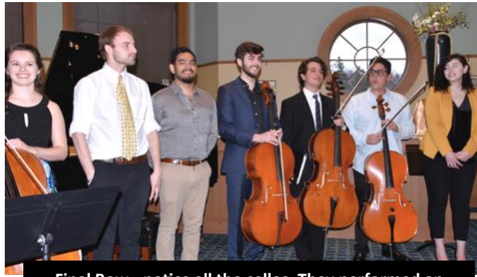
Final Bow - notice all the cellos. They performed an arrangement of Ravel's Bolero . It was a big hit!