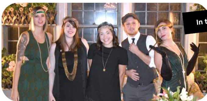
In the 1920s mood for the evening!