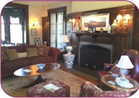
Location: Marchant House

Experience engaging performances by emerging stars in art and antique-filled homes