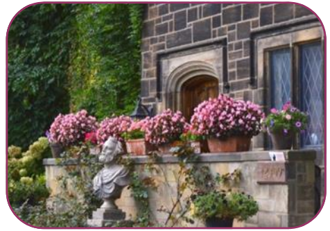
Location: Hart Manor